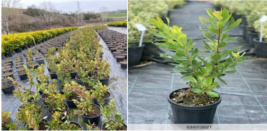
Fig. 1. Images are from the facility where Arbutus unedo is produced in Yalova

The fruit can be consumed fresh for food purposes, and can be used in the food industry as a filler for desserts, in the production of wine, brandy, liquor, jam, jelly, marmalade, to add flavor to yoghurts. In traditional medicine, its fruits and leaves are valuable for their antiseptic, diuretic, antihypertensive, antimicrobial and laxative properties [20]. In addition, its use as a greenery in cut floristry is very common in recent years. Considering that Turkey is an important market for cut greens both at home and abroad in the last years, its production should be supported. The constant search of consumers in this industry, the research of new species, and the development of arbutus production [30]. However, when we examine the Yalova region, which has the highest potential for producers today, it has been determined that very few producers are sold. In the researches made on the internet, we see that it is produced in a small number of nurseries in Ödemiş, Mersin and Yalova. Some of the sellers report that they were brought from abroad. Those who want to use this plant from companies that make landscape design and application report that they cannot find a qualified plant in the form and size they want from the local producer (Fig. 1).