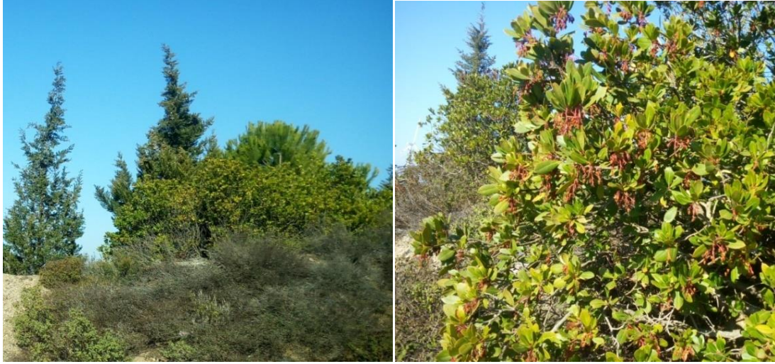
Fig. 2. Arbutus has been located in Karabiga together with the forest plants. (2020).