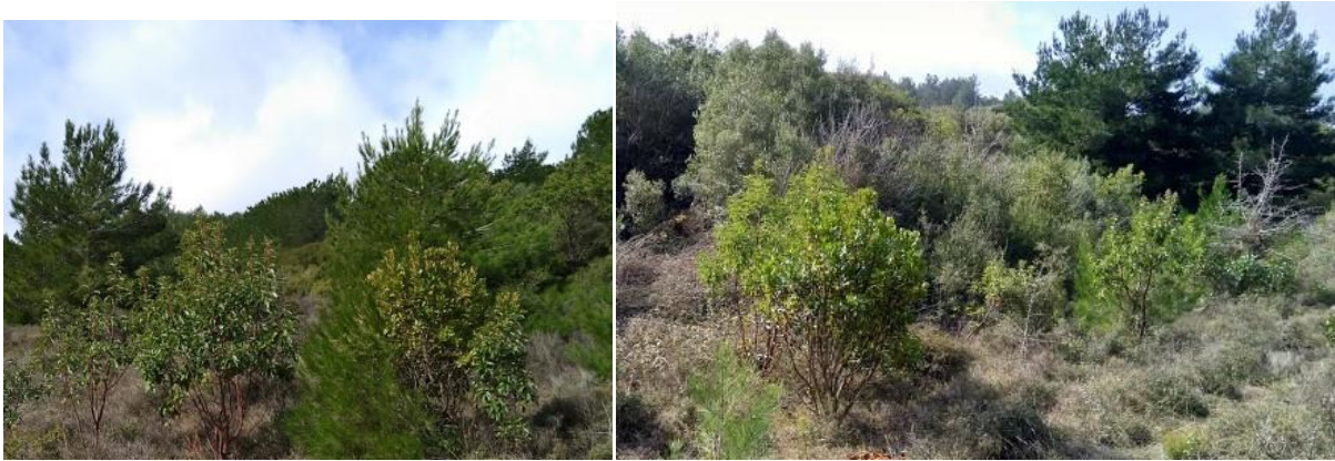
Fig. 3. Arbutus has been located in mixed pine forests around Kocabaşlar village (2020).