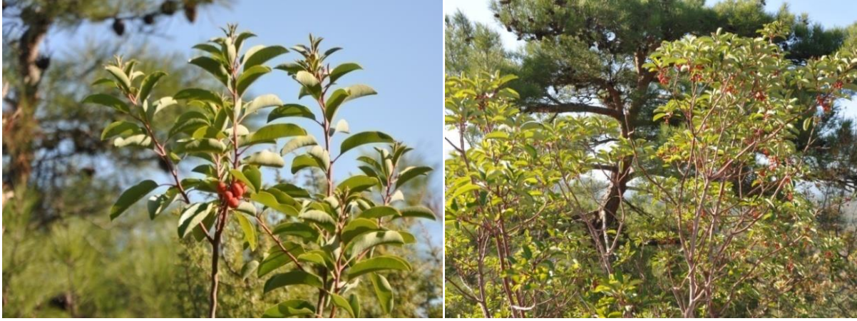
Fig. 4. The view of Arbutus in the forests of Hacigelen Village (2019).

The arbutus plant was determined in its natural environment in Çanakkale region by Şeker et al. (2004) and examined morphologically. Body thickness is 14.61 cm. was measured. Its leaves average 21.42 mm. wide and 52.44 mm. tall and the average petiole length is 7.62 mm. is Flowering period is November-January. In general, the flowers are narrow-tipped, round, bell-shaped. Although the compound petals are cream colored, light pink and pink petaled types have also been encountered. The total number of flowers in the clusters is 29, the number of flowers in the bouquets in the clusters is between 3-6. The average flower length is 7.52 mm. and flower tip opening is 3.27 mm [34].