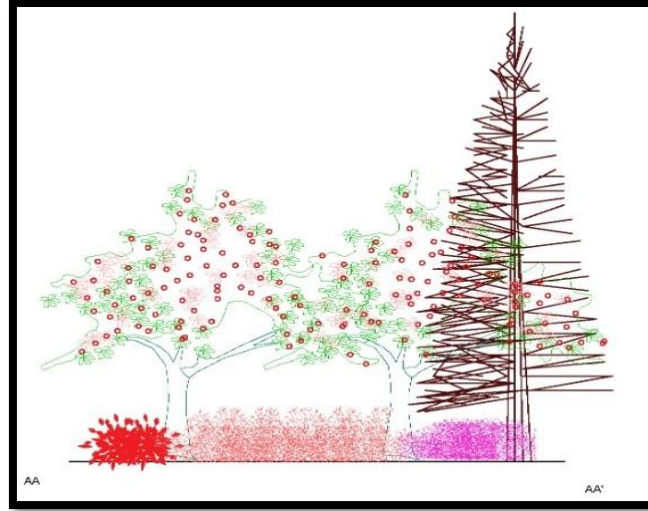
Fig. 5. Plan view of a design sample made with Arbutus unedo L. (Original)

In order to encourage the use of Arbutus unedo in urban landscape design and to determine the possibilities of use, all its features have been tabulated. Thus, considering that the Big Nuts will be designed with different plants, a comparison opportunity has been created (Table 1 and 2).